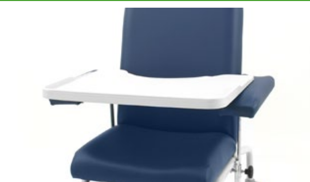
Table 60x47 cm wrap-around recess and folding edges Dx or Sx