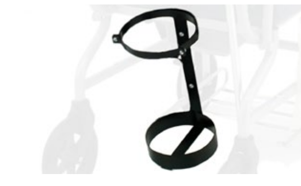
Oxygen cylinder holder basket.