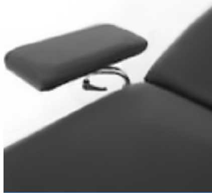
Blood donor - therapy armrest 45x15, adjustable in height.