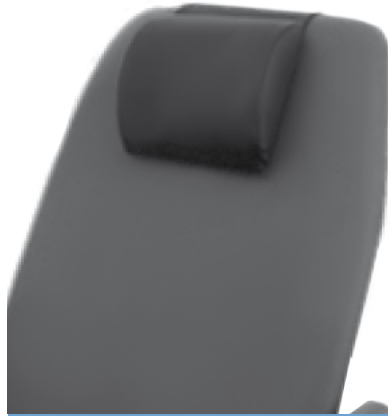
Removable headrest with Velcro strap.