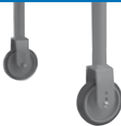
4 wheels diam.100mm (which 2 with brake).