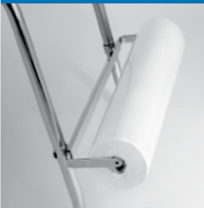
Rollrest in chromed steel.