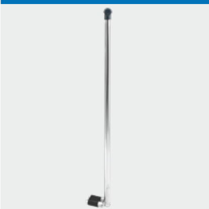
Fixed housing for IV pole diam. 18-22mm.