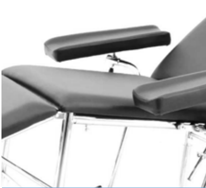
Blood donor - therapy armrest 45x15cm. Tilttable, shaped and height adjustable, 3D angle and depth.