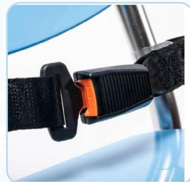
SAFETY BELT WITH QUICK DETACHING SYSTEM