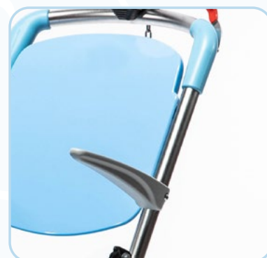
ARMRESTS MADE OUT IN PU