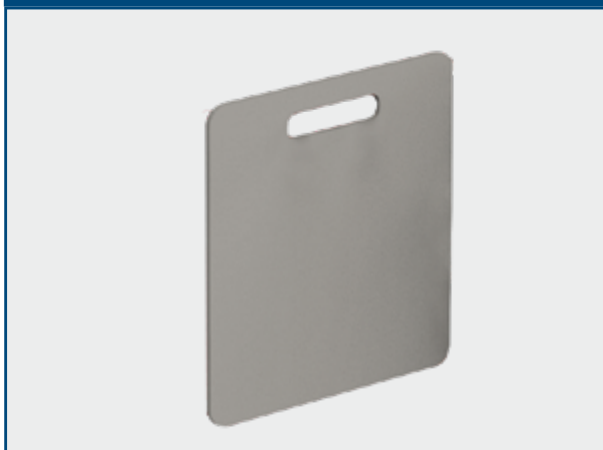
Cardiac massage table