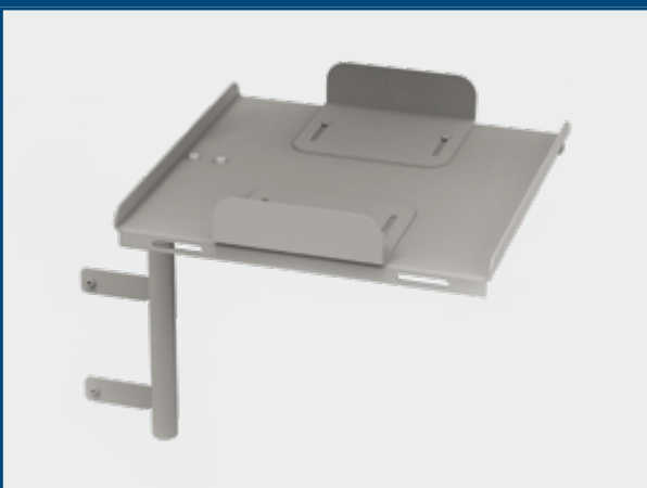
Defibrillator or monitor tray