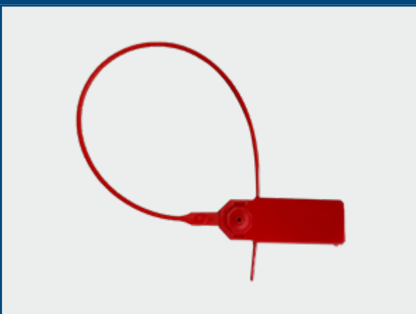
Single-use, unnumbered security seal