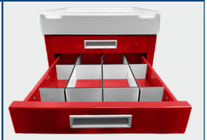
Drawer divider kits: ACCF15/1 - 10 compartments; ACCF15/2 - 15 compartments; ACCF15/3 - 20 compartments; ACCF15/4 - 25 compartments