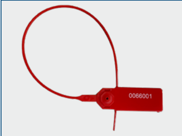
Numbered disposable security seal