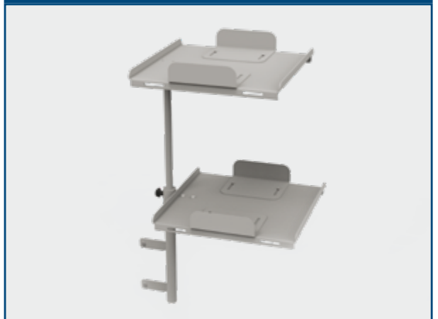
Double defibrillator or monitor tray