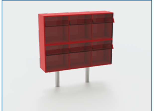
6-drawer sectional chest of drawers