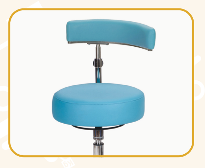
360° REVOLVING BACKREST CAN ALSO BE USED AS AN ARMREST