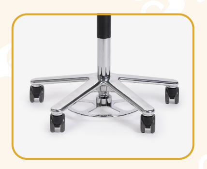
BRAKE ANTISTATIC WHEELS